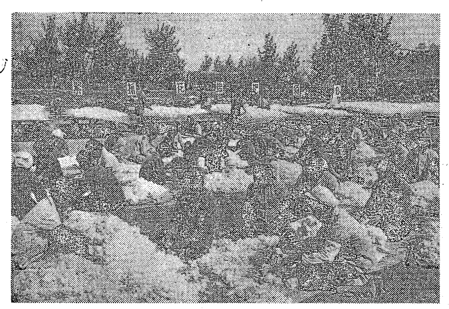
On the heels of ten successive rich grain and cotton harvests, the Kaochengtzu Brigade of the Hsiaotun Commune in Liaoyang city, Liaoning Province, had bumper harvests last year—820 jin of grain and 120 jin of ginned cotton per mu. Picture shows commune members sunning their newly picked cotton.

and "putting stress on industry while neglecting agriculture." This had resulted in a very slow development in Liaoning's agriculture.