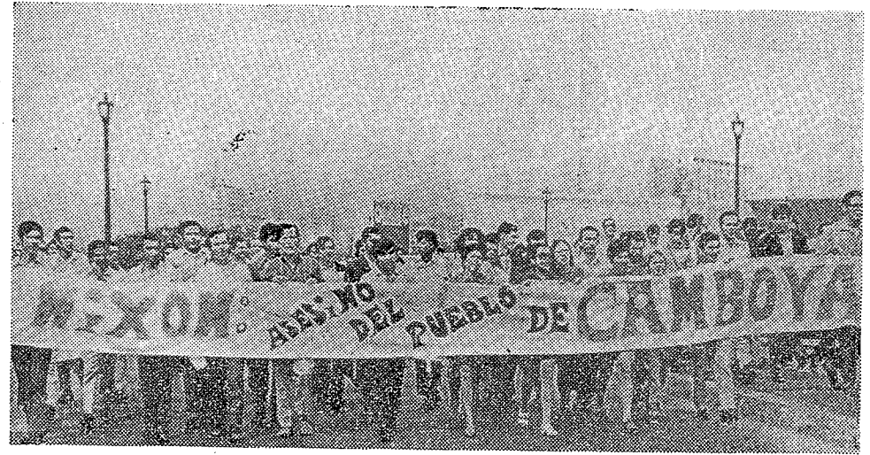
Venezuelan student demonstrators in Caracas protest against U.S. imperialism widening the war of aggression in Indo-China. The streamer they carry reads: "Nixon, assassin of the Cambodian people!"