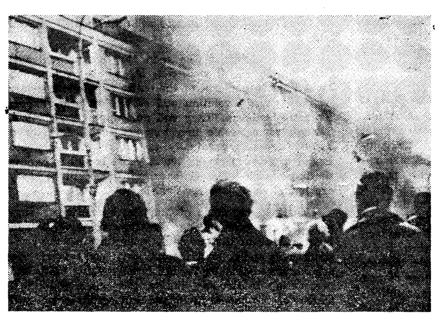
Rising up against the Polish revisionist rule, the revolutionary people in Szczecin angrily set fire to the police headquarters.

After this, the Polish revisionist authorities imposed a curfew on the area of Gdansk, Gdynia and Sopot, cancelled all regular flights to the area, cut off its telephone connections with the outside world, and ordered all foreign vessels in harbour to leave at once. Shouting abuse, the revisionist authorities vilified the demonstrations as the