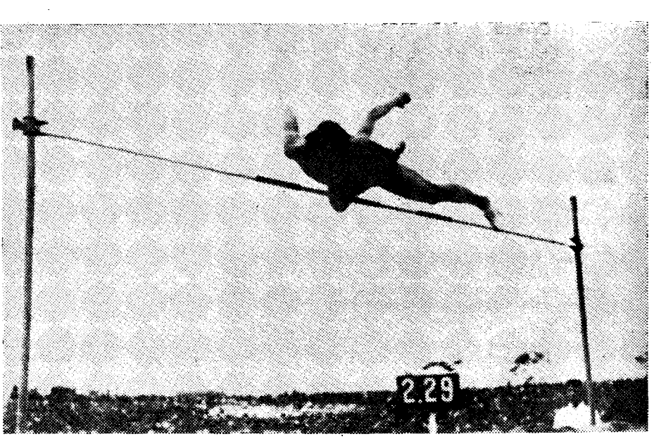
China's outstanding athlete Ni Chih-chin broke the world high jump record by clearing 2.29 metres on November 8.

Yugoslav Ambassador to China Bogdan Orescanin also welcomed