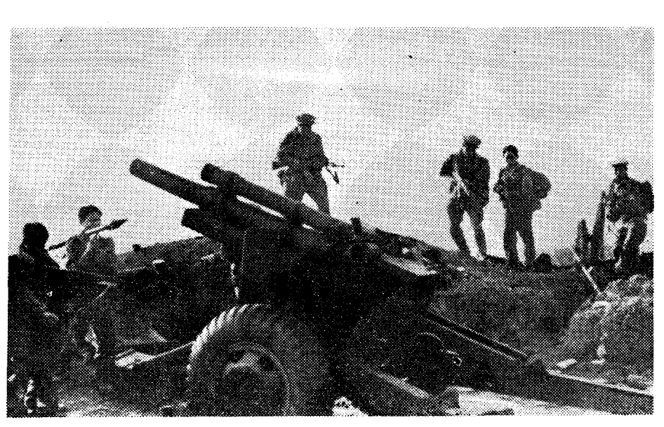
The Laotian People's Liberation Army captures an enemy position.

Since the beginning of the 1969-70 dry season, especially since U.S. imperialism expanded its war of aggression to the whole of Indo-China by sending troops to invade Cambodia, the Laotian patriotic armed forces and people have further strengthened their fighting solidarity with the Cambodian and Vietnamese peoples, and badly battered U.S. imperialism, throwing it into difficulties both at home and abroad. The Laotian patriotic armed forces have not only won back the Plain of Jars-Xieng Khoang area, but also liberated Attopeu in late April and Saravane City and its surrounding areas in early June, both of which are important strategic points in Lower Laos. This has linked up the liberated areas of Laos, the Tay Nguyen liberated area of south Viet Nam and the northern liberated area