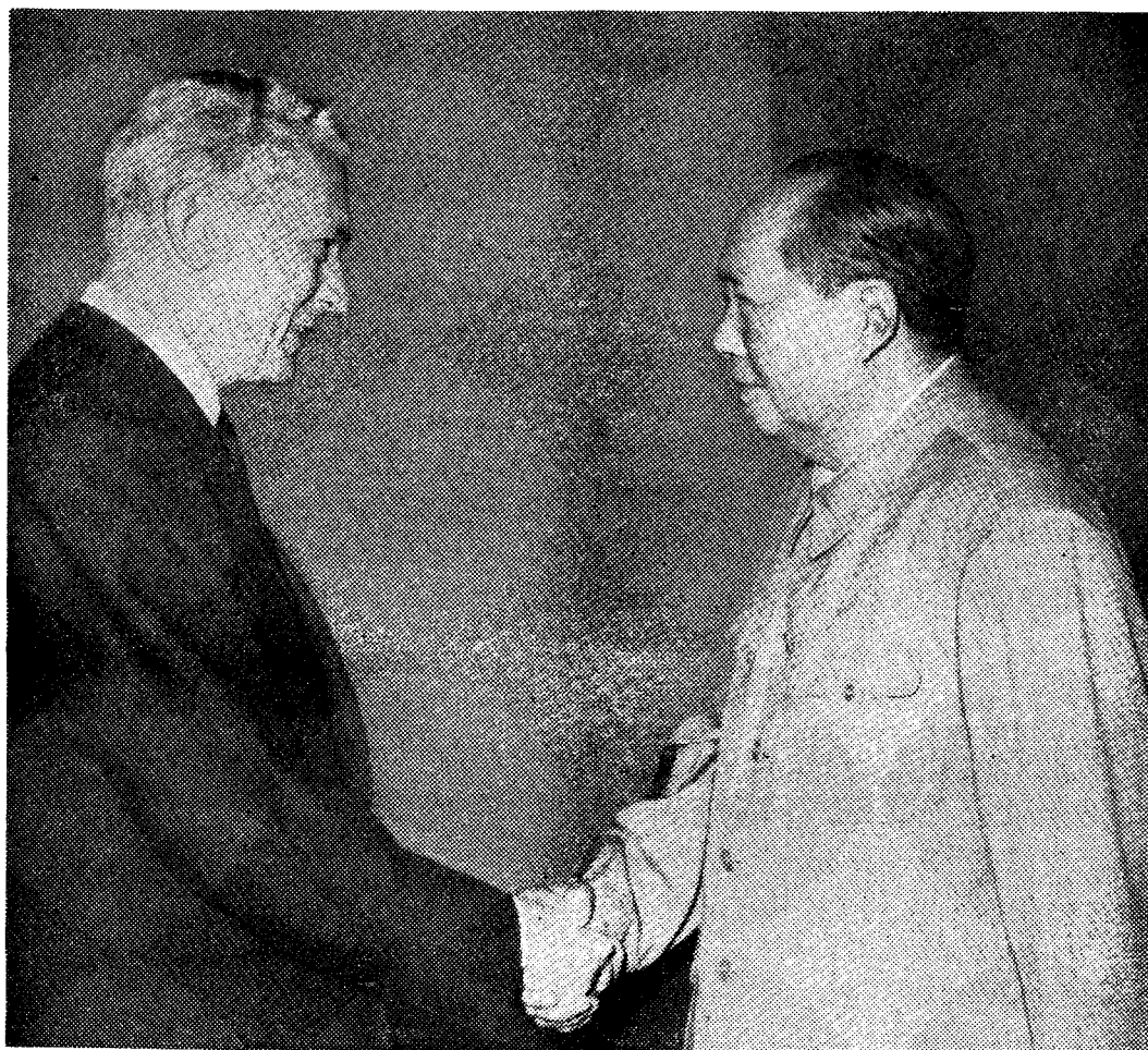
Chairman Mao warmly shakes hands with Couve de Murville.