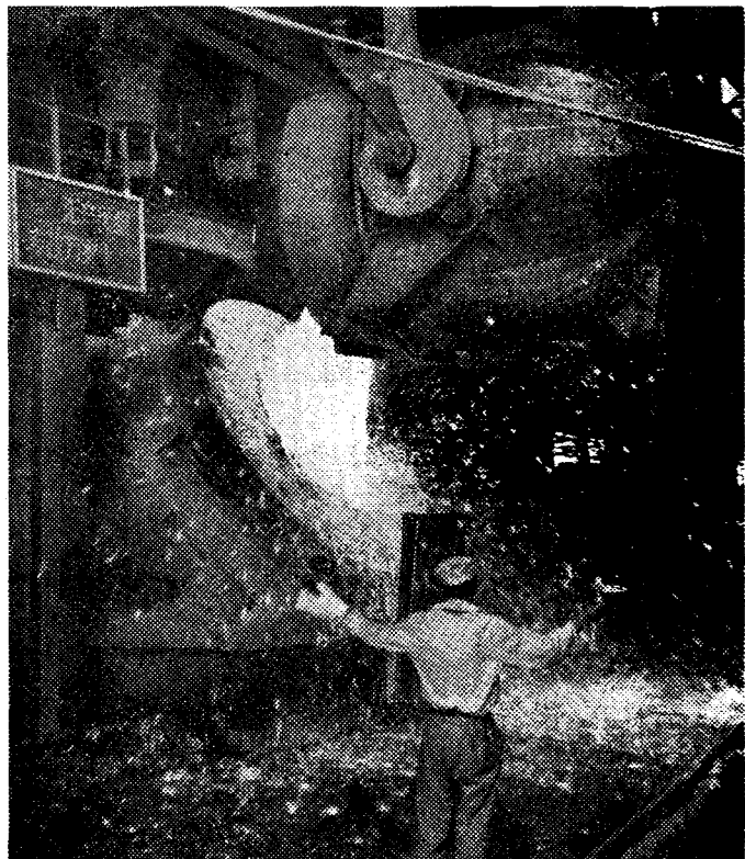
Following Chairman Mao's great teaching "Maintaining independence and keeping the initiative in our own hands and relying on our own efforts," revolutionary workers at the Paotow Iron and Steel Company speedily built a big high-quality pure oxygen top-blown converter in only 50 days.

After winning a rich harvest, the poor and lower-middle peasants and other commune members promptly delivered their best grain as tax in kind and sold it as surplus grain to the state in support of the socialist revolution and construction. By the end of July, the nation's quotas for collecting tax in kind and the