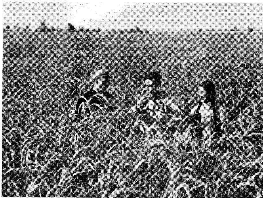
The No. 7 Production Team of the Huachiang Brigade in Lintse County's Hsiaotun Commune, Kansu Province, had a rich grain harvest this summer. As seen in photo, the team expects a bumper autumn harvest.

Our great leader Chairman Mao long ago pointed out: " In socialist revolution and socialist construction we must adhere to the mass line, boldly arouse the masses and launch vigorous mass movements. " Following Chairman Mao's teachings, Peking's workers have adhered to the mass line and launched vigorous mass movements. By concentrating their strength to fight a battle of annihilation in the first half of the year, they organized city-wide mass co-ordination to bring about fundamental changes in such formerly weak in-