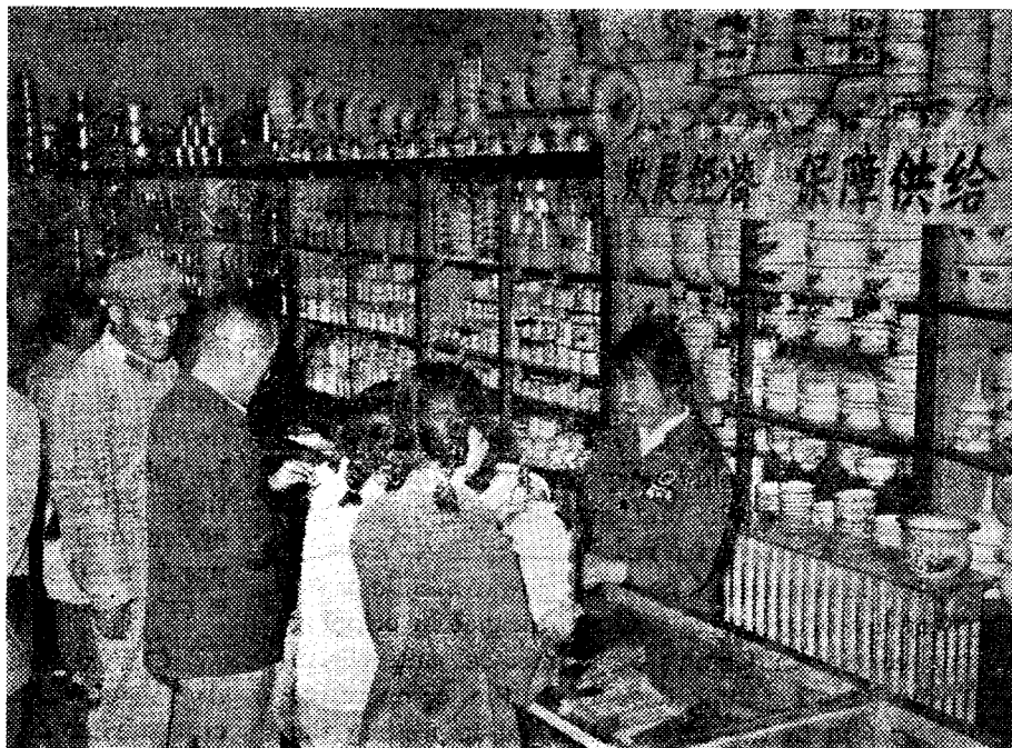
Commercial workers in Peking's Tungfeng Market serve the workers, peasants and soldiers wholeheartedly. A saleswoman is warmly helping revolutionary people choose enamelware.

Acting according to the great leader Chairman Mao's teaching "Develop the economy and ensure supplies" — the general principle governing economic and financial work — trade departments have vigorously promoted and aided industrial and agricultural production and ensured the supply of consumer goods to the working people in the cities and countryside. During the Great Proletarian Cultural Revolution, the commercial workers have criticized in a sustained and deep-going way Liu Shao-chi's counter-revolutionary revisionist trash, such as "the theory of serving the whole people" without making any distinction between classes, "putting profits in command" and "giving first place to vocational work." They have come to a deeper understanding of the absolute correctness of Chairman Mao's principle "Develop the economy and ensure supplies," and greatly raised their consciousness of firmly carrying out this principle. Firmly adhering to this principle of Chairman Mao's, the personnel of the Shihpanyen Supply and Marketing Co-operative of Linhsien County in Honan Province have over the past 24 years upheld and carried forward the spirit of "making revolution with a carrying-pole" and worked hard in a mountainous area. To support socialist construction and the world revolution, they car-