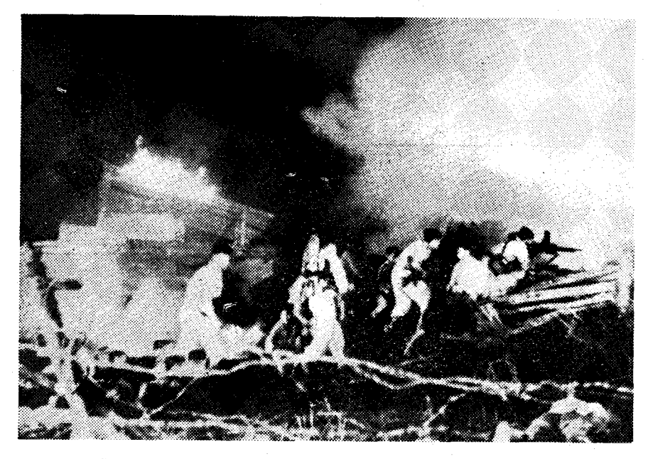
South Viet Nam P.L.A.F. attack a U.S.-puppet strong-point.

Taking advantage of the fact that the U.S. aggressor troops and the south Vietnamese puppet troops have been dispersed since the invasion of Cambodia, the People's Liberation Armed Forces in the Quang Tri-Thua Thien-Hue area and the Mekong Delta frequently attacked enemy bases and communication lines. They smashed his "pacification" scheme and put large numbers of enemy forces out of action. In May alone, they mounted more than 1,000 attacks on the enemy's bases and strongholds and inflicted on him 38,000 casualties, dealing the U.S. and puppet troops heavy blows. Saigon, Da Nang, Da Lat, Cam Ranh and other important sup-