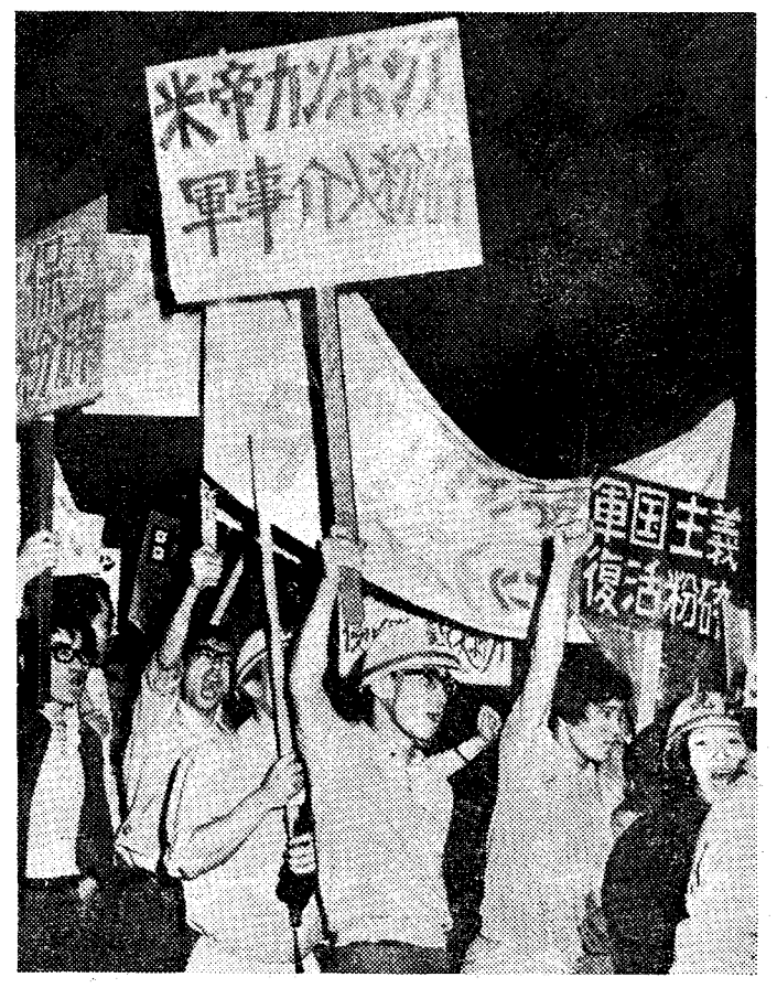
People in Tokyo demonstrate against the revival of Japanese militarism.

Mao's solemn statement has greatly enhanced the courage and armed the minds of the Japanese people in their struggle against the U.S. and Japanese reactionaries.