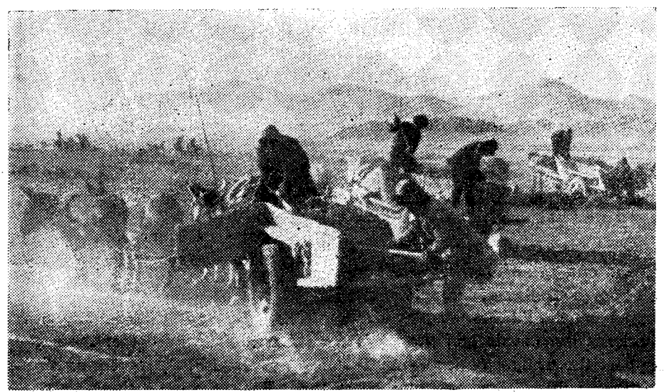
The poor and lower-middle peasants of the Paitayu Brigade in Hsingcheng County, Liaoning Province, and People's Liberation Army men supporting agriculture deliver fertilizer in cold weather, determined to win rich harvests.

Amid the high tide of preparing for spring farming, industrial, financial, trade, transport and health departments in different places send out, on their own initiative, investigation groups, mobile services and medical teams to the villages or the fields to enthusiastically work for the spring farming preparations.