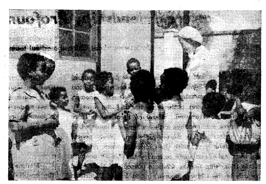
Chinese medical worker in Martino Hospital with Somali children