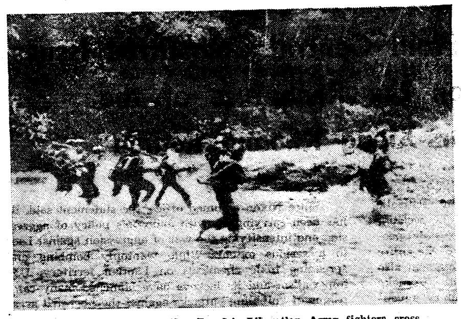
Pursuing the enemy, Laotian People's Liberation Army fighters cross river to wipe them out.

The monstrous crimes of U.S. imperialism and its stooges have aroused the unbounded indignation of the patriotic armed forces and people of Laos, parti-