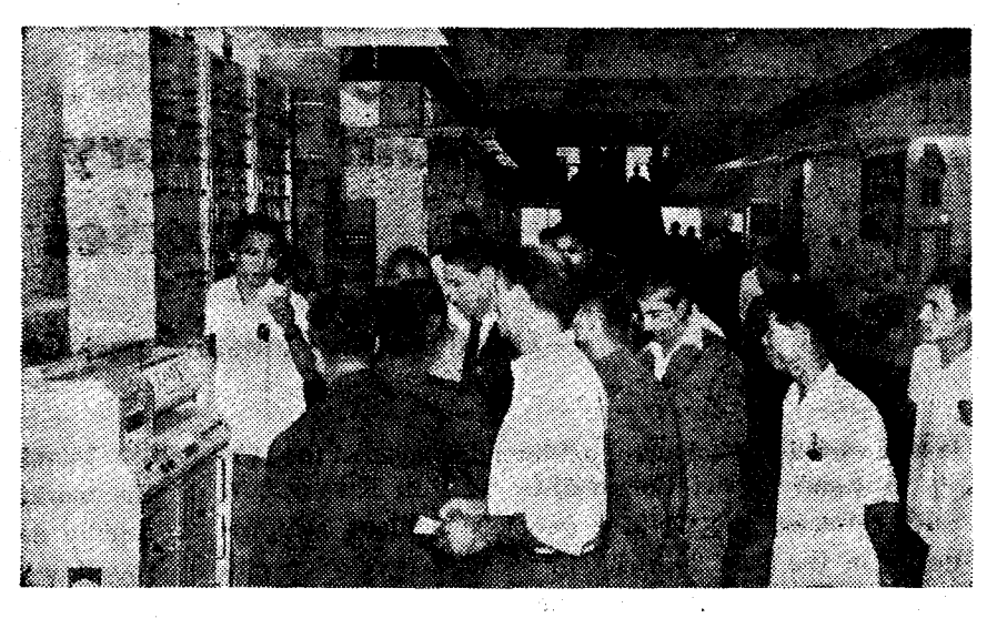
Foreign friends at China's Autumn Export Commodities Fair see the Dongfanghong-1 press facsimile.

The new-type Dongfanghong-100 horizontal boring machine turned out by the Shenyang No. 2 Machine Tool Plant, the new types of automatic internal grinding machine MZ-208 and automatic ball-bearing inner race grinding machine MZ-1310 made by the Wusih Machine Tool Plant were on display in the Machine-Building Pavilion and were all produced by workers in the high tide of the struggle-criticism-transformation movement by relying on invincible Mao Tsetung Thought. When the Chinchuan Machine Tool Plant in Paochi, Shensi Province, produced China's first QC-001