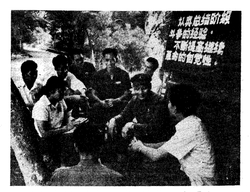
Members of the workers' and P.L.A. men's Mao Tsetung Thought propaganda team in the Chungshan Medical College talking over their experience in leading the college's strugglecriticism-transformation movement and discussing how to carry the socialist revolution in the realm of the superstructure through to the end.

One woman teacher in the teaching and research group on neurology was deeply poisoned by the revisionist educational line. In 1960 the leadership assigned her to join the research work on occupational diseases in factories and mines. This is a topic of scientific research which genuinely serves the labouring people.