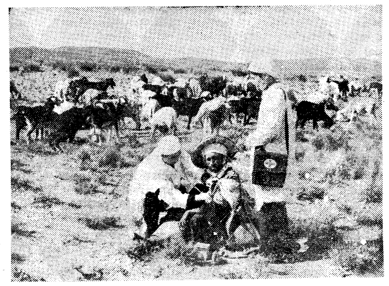
Chinese medical personnel making their rounds in the Sahara Desert's stock-raising areas to treat local herdsmen

But rejoining the hand was only the first step, for it was threatened by possible complications. The key problem was to give the patient the most meticulous nursing care. To solve this, the Chinese doctors personally took on the nursing and did it in turn, looking after the patient day and night, closely watching developments and giving careful and timely treatment. But just when the colour of the skin of the rejoined hand was returning to normal, an accident took place: without first consulting the doctor, the mother washed the still feeble hand with hot water, causing many blisters. The hand became very swollen with continuous exudation. The skin completely peeled off. However, thanks to the determined efforts of the Chinese doctors, the hand was again saved.