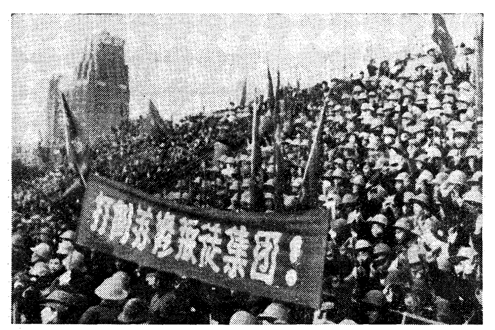
Shanghai's working class and revolutionary masses held rallies to voice their strong protest against Soviet revisionist armed provocations and express their resolute determination to overthrow the common enemy of the Chinese and Soviet peoples, the Soviet revisionist renegade clique.

certainly rise to overthrow the Soviet revisionist renegade clique's fascist rule. The broad masses of armymen and civilians pointed out: The Soviet revisionist renegade clique is the common enemy of the peoples of China and the Soviet Union. The peoples of the two countries have established a profound friendship in their protracted revolutionary struggles. Under the brilliant banner of Marxism, Leninism, Mao Tse-tung's thought, the Chinese and Soviet peoples will certainly unite still more closely and overthrow the new tsars once and for all.