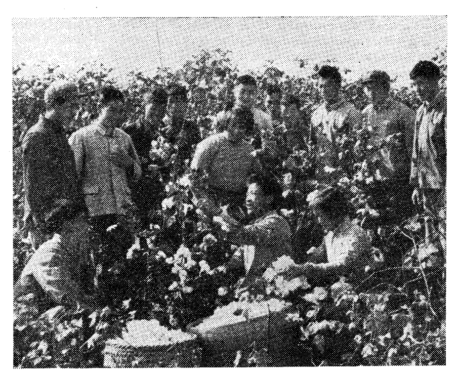
Summing up the experience of the local poor and lower-middle peasants, the "indigenous experts" of the Yuejin brigade, Kiangsu Province in east China, experiment with a plot of cotton which gives a high yield.

A comparison between two agro-technical stations also shows that the masses love the "indigenous experts" and dislike the intellectuals who delight in empty talk. One is the county agro-technical station equipped with tape measures, sprayers, balances and many other kinds of measuring and testing apparatus. The other is the commune agro-technical station which has neither equipment nor "foreign" technical literature. On the matter of division of labour, there is also a marked difference. The county agro-technical station has a minute division of labour with everyone looking only to his own specialty. The person in charge of cotton does not concern himself with rice cultivation and the one in charge of rice does not think about cotton. In the commune agro-technical station, everyone pays attention to the work as a whole, though there is some division of labour. When some of the agro-