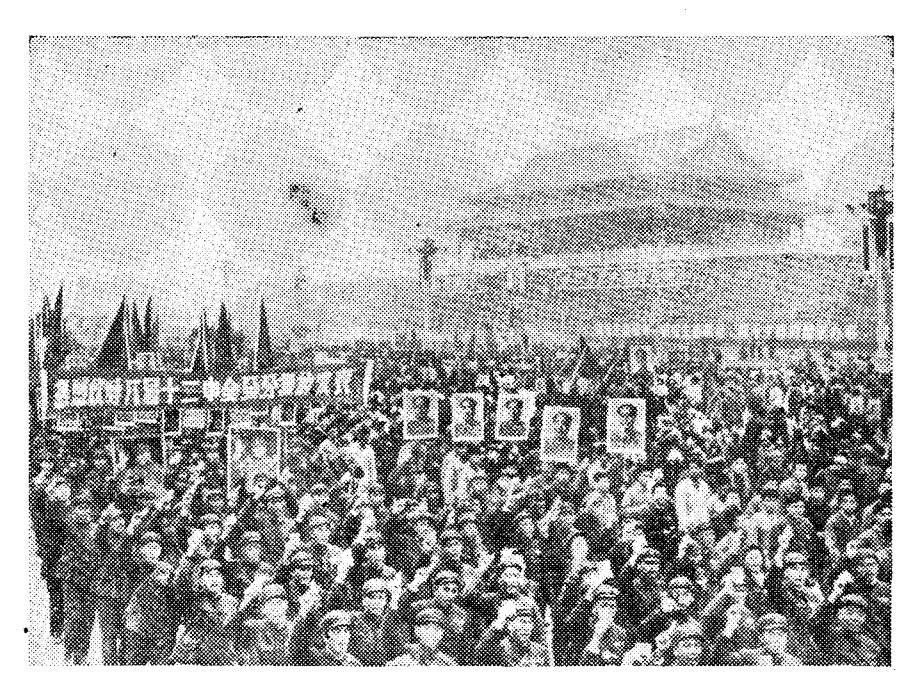
The publication of the Communique of the Enlarged 12th Plenary Session of the Eighth Central Committee of the Party has inspired China's hundreds of millions of armymen and civilians. In the past few days, they have held many celebration parades. These are paraders in the capital, Peking,