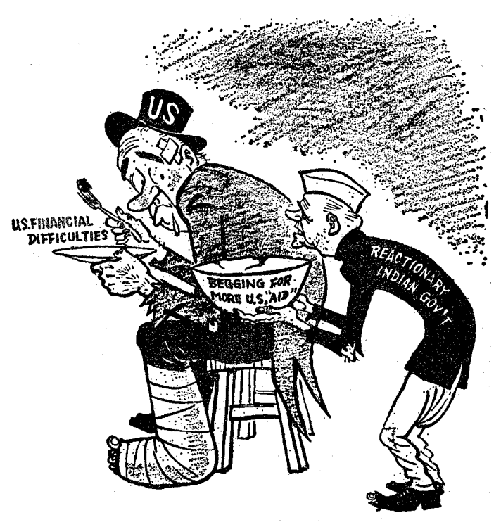
Master and Slave

The food shortage and the awakening of the Indian peasants are harbingers of a new revolutionary storm on a larger scale.