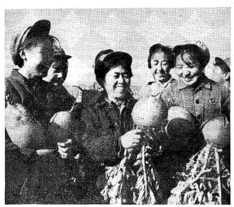
Women students of the Liuho "May 7" Cadre School joyfully harvest the large turnips they have grown, deeply appreciating the truth that labour creates social wealth.

Chairman Mao teaches us: "This change in world outlook is something fundamental." In order to dig up the roots feeding revisionism among cadres, the fundamental thing is to remould their world outlook. Therefore, from the day it was founded, the "May 7" Cadre School set itself, as a matter of prime importance, the task of remoulding its students' world outlook.