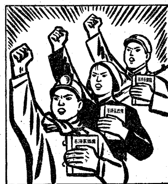
WORKERS, PEASANTS, SOLDIERS ON WORLD AFFAIRS

After Khrushchov came to power, Soviet agriculture got into a terrible mess. The successors to his counter-revolutionary revisionist line, Brezhnev, Kosygin and company, brought about an all-round restoration of capitalism in the Soviet Union, which led to a further deterioration in agriculture. The Soviet Union, which used to export grain, was compelled to sell a great quantity of gold in the West in order to pay for imported grain. In addition, there is an extreme shortage of ordinary non-staple foods.