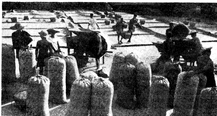
Members of the Dongfeng People's Commune in Pih sien County, Szechuan Province, winnowing, sunning and bagging their rich harvest of rice to sell to the state

A test of the grout at an actual building site needed low temperature in winter conditions. But it so happened that the cold weather had not yet set in when they were ready for the test. To gain time, they therefore made the test in the early mornings when temperatures were relatively low. This provided good enough conditions for collecting the necessary data and the chemical grout was finally successfully developed.