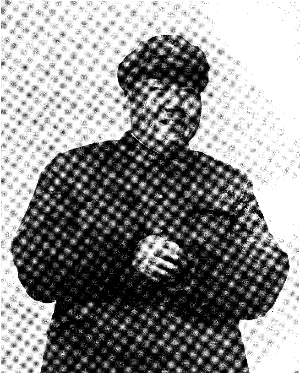
Chairman Mao Tse-tung, our great teacher, great leader, great supreme commander and great helmsman, reviewing revolutionary students and teachers and young Red Guard fighters for the eighth time