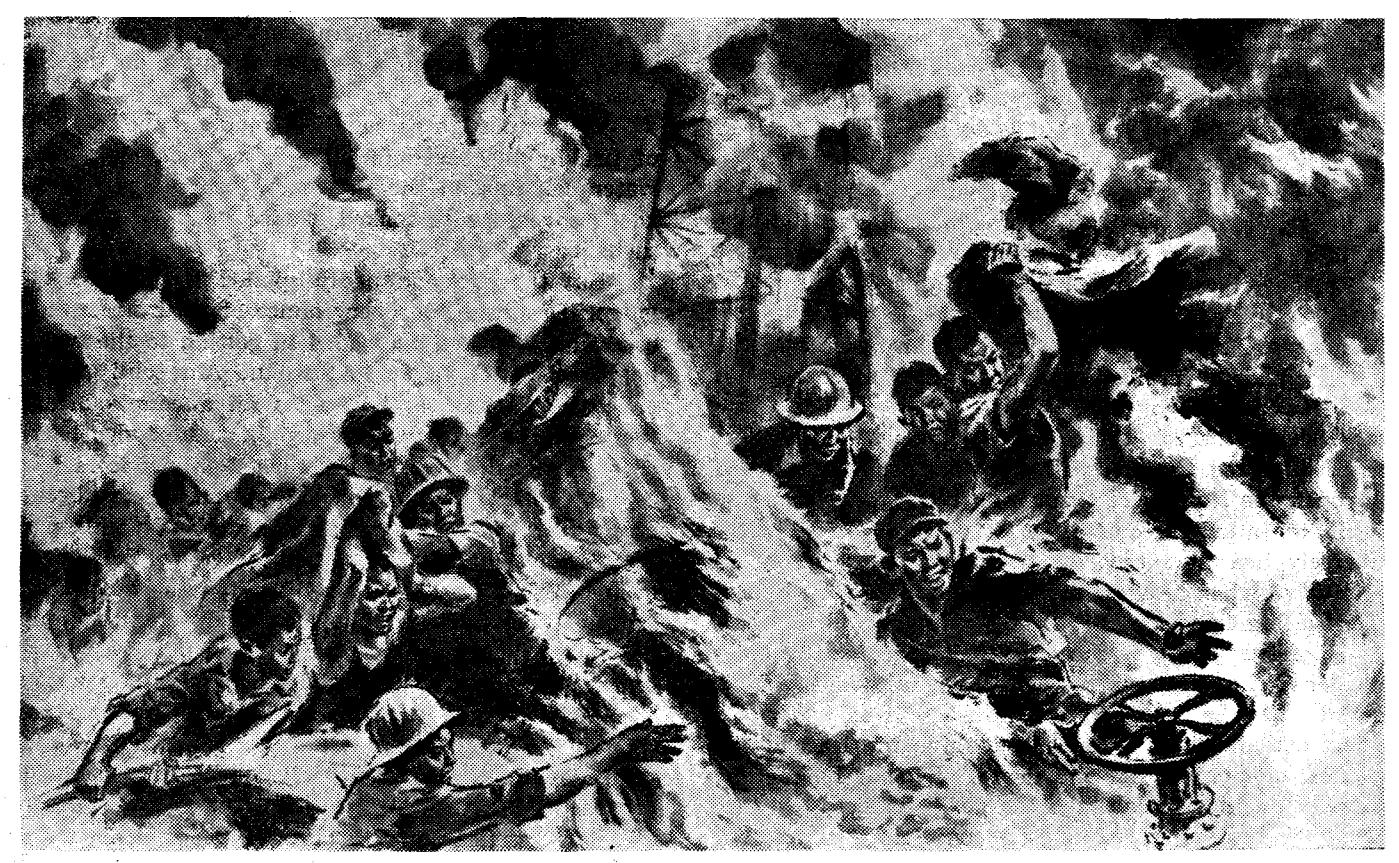
Heroes of the No. 32111 Brilling Team, armed with Mao Tse-tung's thought, dare to scale a mountain of swords, dare to brave a sea of raging fire

posts to the very end and heroically fought on until they had given their very last measure of blood for the Party and the people.