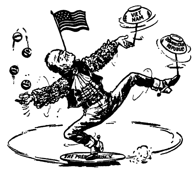
Beaton in "The Toronto Telegram," Canada

Gap Between "Objective" and "Power." In this respect, the gap can be summarized as a contradiction between Washington's wild ambition for world domination and its limited available strength. The present size of the