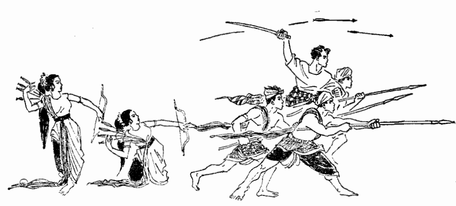
"Dance of the Struggle for Independence"