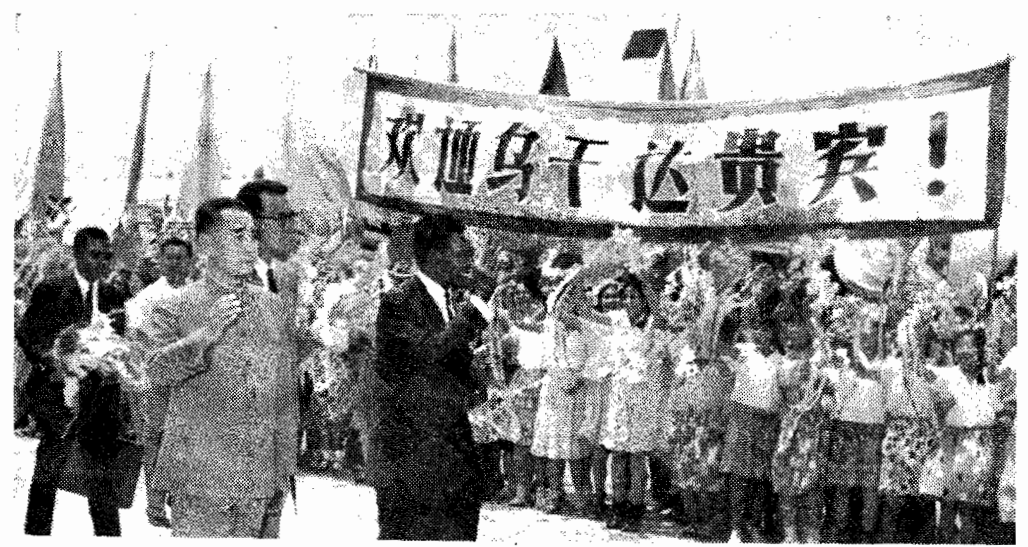
Prime Minister Obote, accompanied by Premier Chou, waves to welcomers at the Peking Airport

Leading Chinese newspapers frontpaged the news of the visit. Renmin Ribao in a July 12 editorial extended a warm welcome to the guests from Uganda.