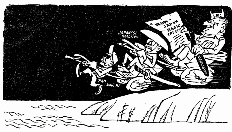
Rickshaw Boys and Their Master

The Chinese Government and people have all along supported the just struggles of the Korean and Japanese peoples and strongly condemn the criminal activities of U.S. imperialism in promoting the sinister collaboration of the Japanese reactionaries and the Pak Jung Hi clique. The signing of the "ROK-Japan Basic Treaty" and the related "agreements" is a grave provocation not only against the Korean and Japanese peoples, but also against the Chinese people and the peoples of other Asian countries. The Chinese Government will never recognize the so-called "ROK-Japan Basic Treaty" signed by the Japanese Government and the Pak Jung Hi clique. The 650 million Chinese people will stand unwaveringly with the Korean and Japanese peoples as well as with the peoples of other Asian countries in carrying to the end their struggle against the U.S. imperialist scheme for using the reactionaries of Japan and the Pak Jung Hi clique to expand its aggression.