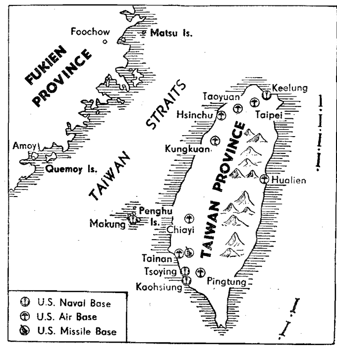
Sketch map by Wang Chieh

"Aid" and Control. Between July 1950, and June 1965, the United States supplied the Chiang Kai-shek gang with military "aid" to the tune of more than U.S. $2,600 million. Through this military "aid," the U.S. has provided the Chiang Kai-shek gang with all kinds of arms and military equipment. The so-called U.S. "Mi-