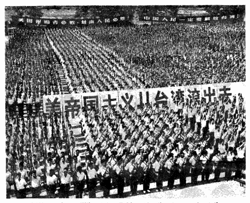
10,000 people's militia at the Peking Shooting Range shout the slogan: "U.S. Imperialism, Get Out of Taiwan"

In Shanghai, 30,000 militia members, including former volunteers in the Korean war, veterans of the resistance war against Japan and the war of liberation against the Chiang Kai-shek reactionaries, militiamen and women composed of advanced workers, school teachers and students, shop clerks and government employees met at the People's Square, the former "Race Course" where before liberation British and American troops used to march