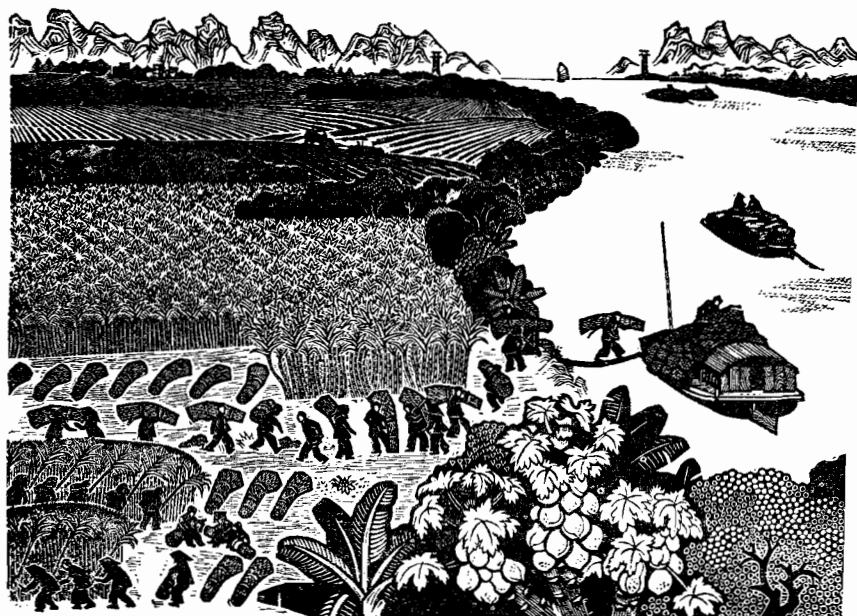
Another Big Sugar-Cane Harvest