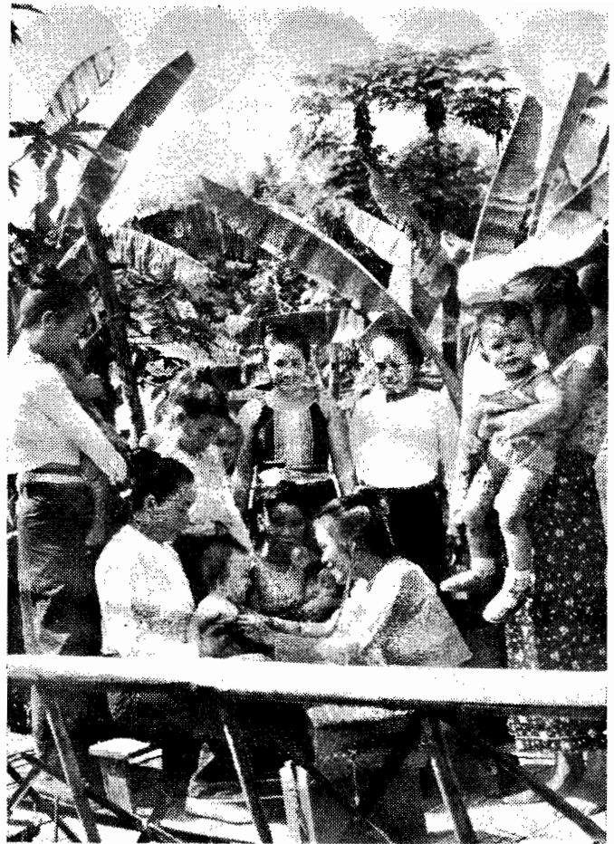
A Tai doctor on her round

Swift progress has also been made in culture and education. Fifteen years ago, most of the 21 minorities here had no written languages of their own. Some had very incomplete ones. Among others, there was not a single person who could read or write any language. Not a few of them made nicks on wooden boards