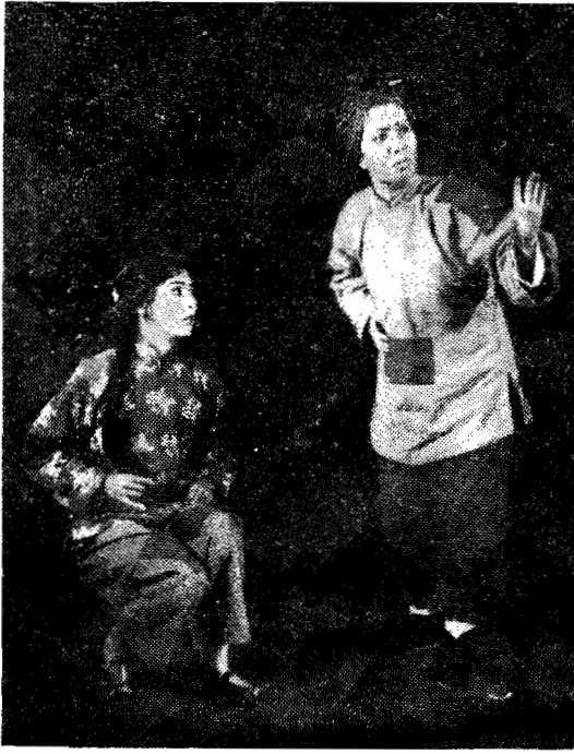
Grandmother tells Tieh-mei of the family's past

expression of feeling. His first appearance leaves a deep impression.