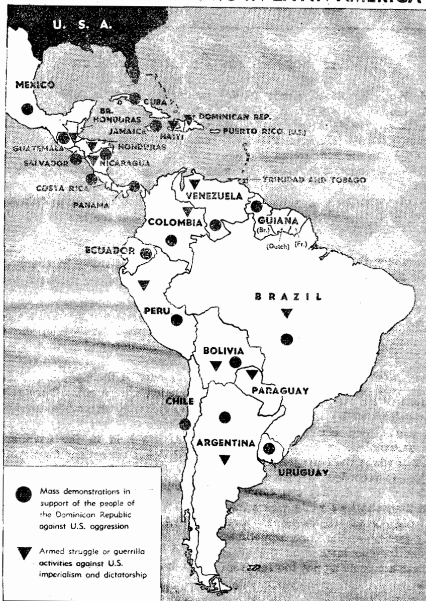
Sketch map by Su Li

two dozen policemen from Costa Rica and dozen tag contingents from Brazil, Nicaragua and Honduras) is a basically Yankee set-up with U.S. General Bruce Palmer as boss. The Central Bank has been taken over by Palmer's men. But attempts to occupy the National Palace near the U.S.-controlled "international safety zone" have met with stiff resistance from the patriotic forces. Fighting is reported around the palace, near the "military corridor" established by the U.S. troops and at other points in the capital.