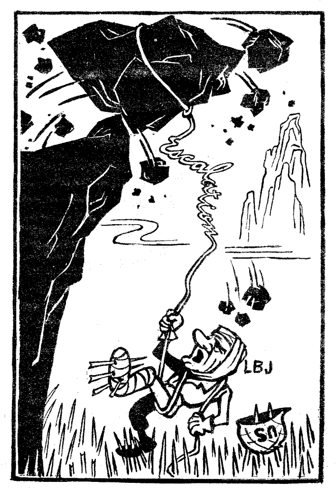
In South Viet Nam: Way Out?

In view of the insecurity of the air force bases, three more aircraft carriers have been brought in. But even if all 12 U.S. aircraft carriers in the Pacific are deployed in this area it would only mean 12 more airfields on the sea. What can a few more aircraft carriers do since the outcome of the war in south Viet Nam has to be decided on land?