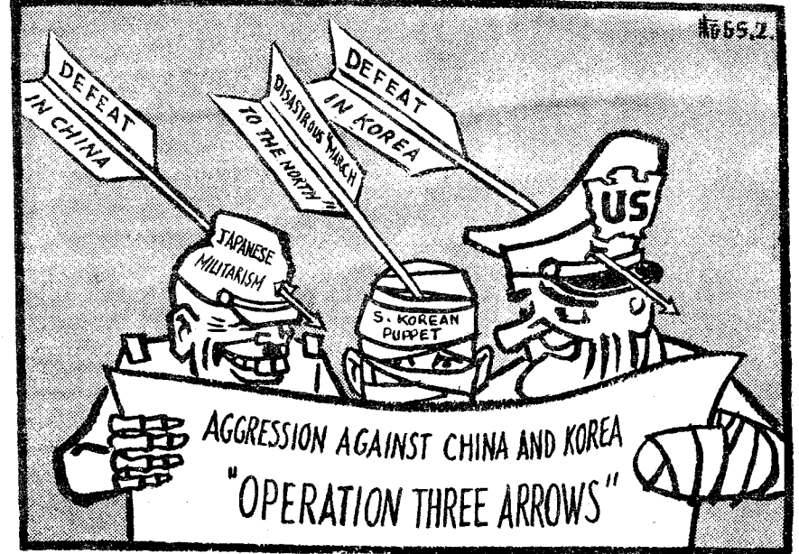
Have They Forgotten?

Since Eisaku Sato took office, the Japanese militarists have become more active. Japan's military budget has increased year after year, and the "self-defence corps" of the Japanese Army, Navy and Air Force have been further expanded. The secretariat of the Japanese National Defence Council is drawing up a plan for mobilization of materials in direct support of the military fascist system, a plan for the operation of ports and highways, a legal system, a plan for directing the national ideology, and so on. The Japanese militarists also are energetically advocating the revision of the Japanese Constitution so that they can advance their arms drive and preparations for war and carry out their plot to send troops abroad. All this fully shows that the Japanese militarist forces have occupied a certain place among those in power and are not outside the government. No wonder that after the secret war plan of the Japanese "Defence Agency" was made known, Japanese Prime Minister Eisaku Sato and Junya Koizumi, director of the "Defence Agency," openly declared that "research" such as "Operation Three Arrows" was "a matter of course." Koizumi even brazenly shouted that "the research will continue in the future."