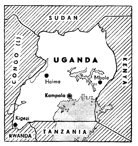
Sketch map by Su Li

In Parliament many members demanded breaking off diplomatic re-