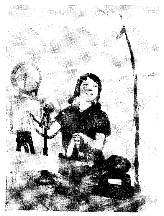
Introducing the Story Before the Film Starts Woodcut by Wu Ching-hsun and Yu Chin-ku

Taking Shantung Province as an example, it now has 467 mobile cinema teams touring its countryside. Each has a fixed round with certain villages picked as regular cinemashowing centres. There are 34,000