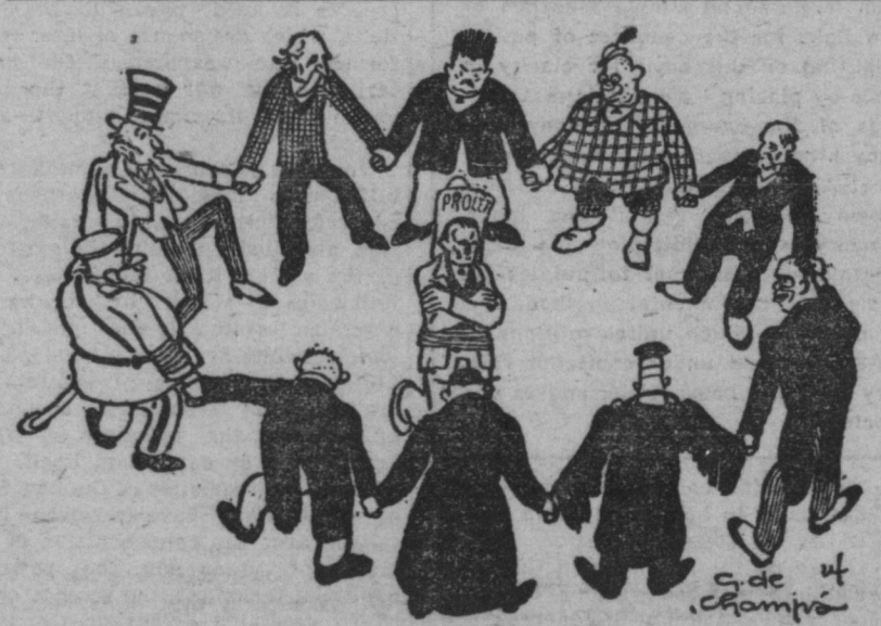
The United Front of Capital

mind the regular republicans, the tion for the revolutionary movement. LaFolletteites and the Salvation Army that were holding forth in the same zones.