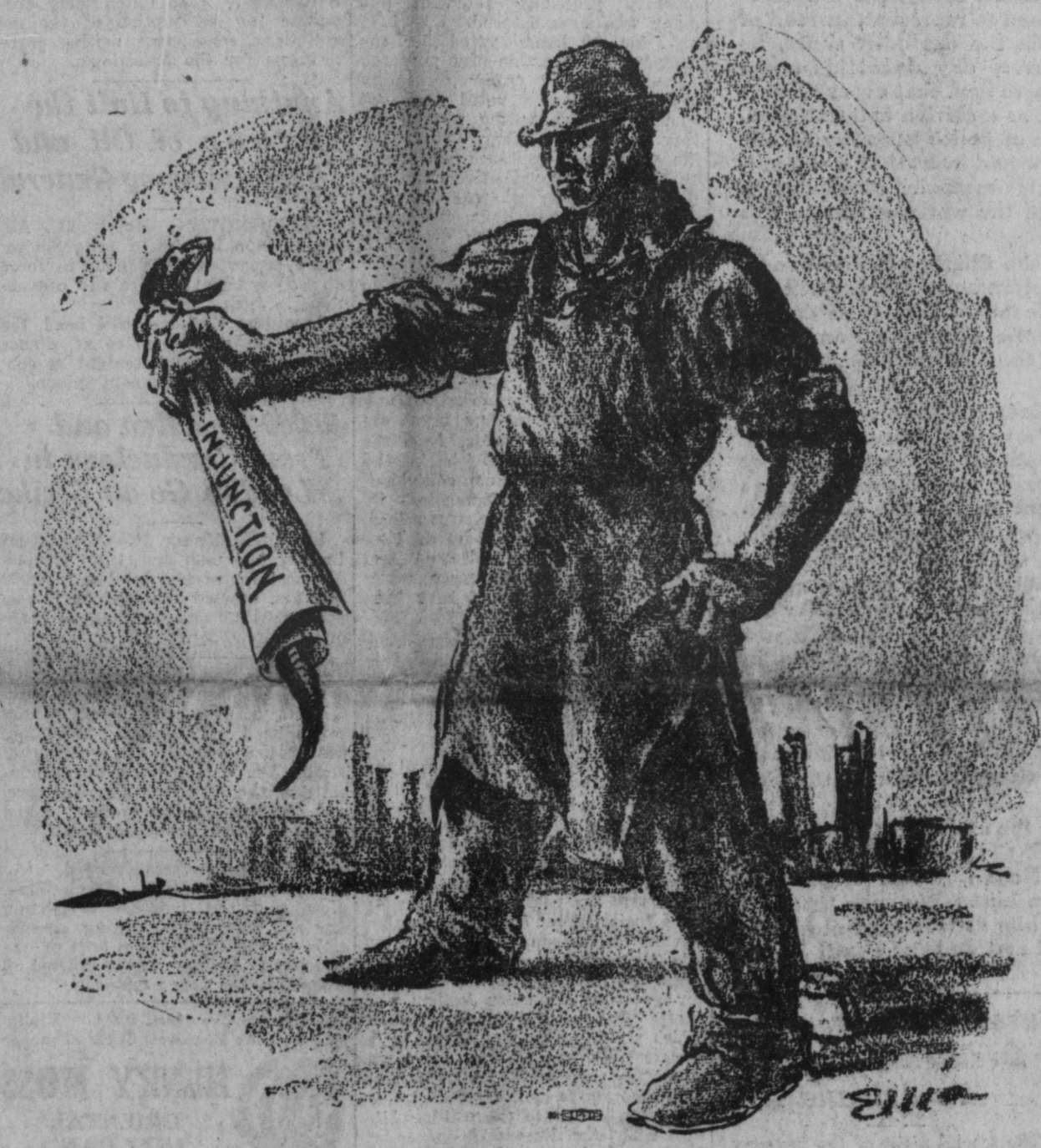
Labor Is Powerful Enough to Crush Its Enemies.