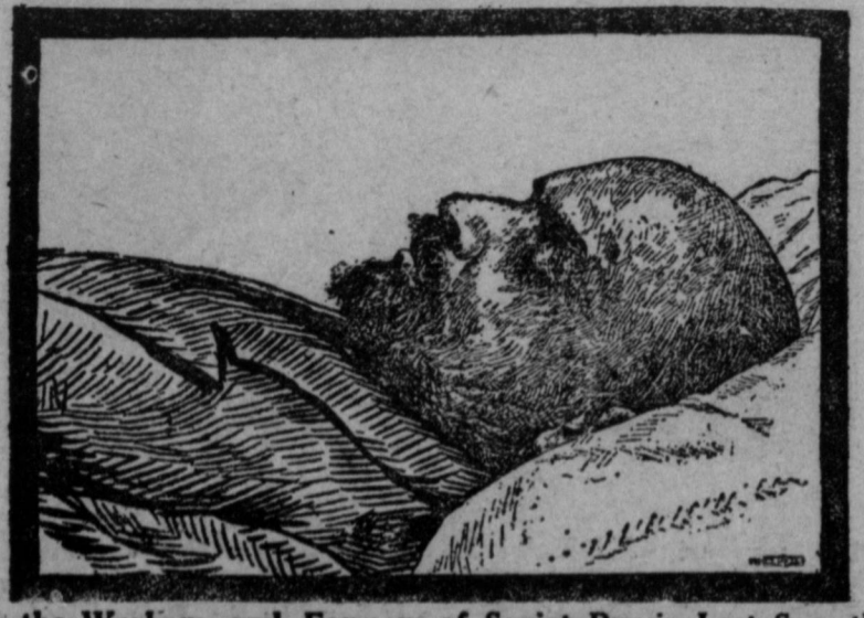
As the Workers and Farmers of Soviet Russia Last Saw the Face of Their Dead Comrade.