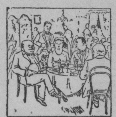
DOT dem Seedy-Erick