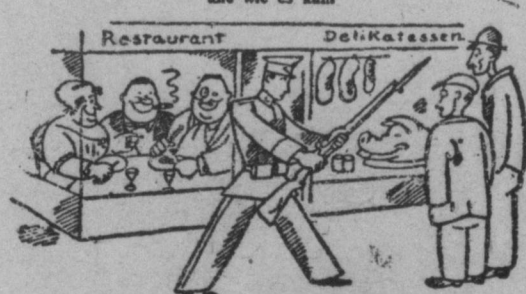
"Schutz dem Reichfum"