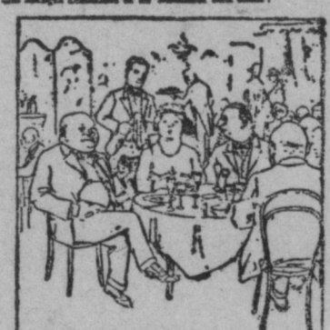
Nadi dem Seedel-Erlaß:

Wie de Reichswehrfoldat Schulze fich seinen Beruf dachte.