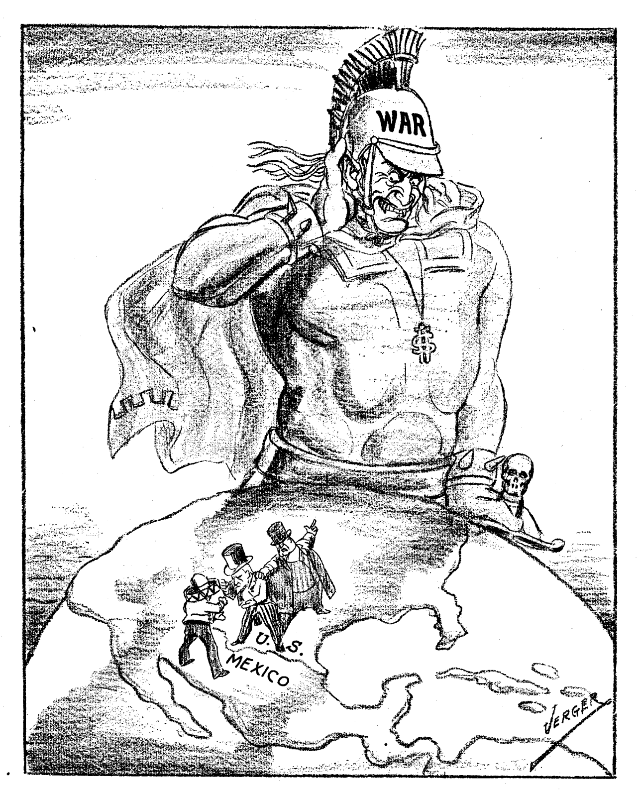
AMERICAN CAPITAL (to his hired man): "You just go right on! When the time comes I'll call in the big fellow there to back you up!"