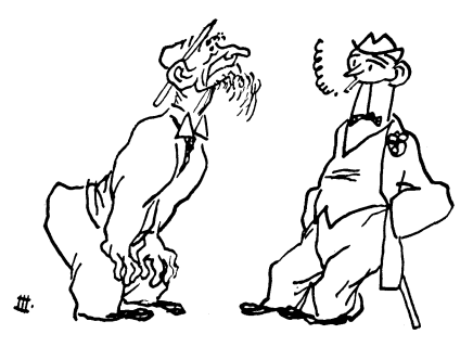
And ate pompernickle, bread and water!