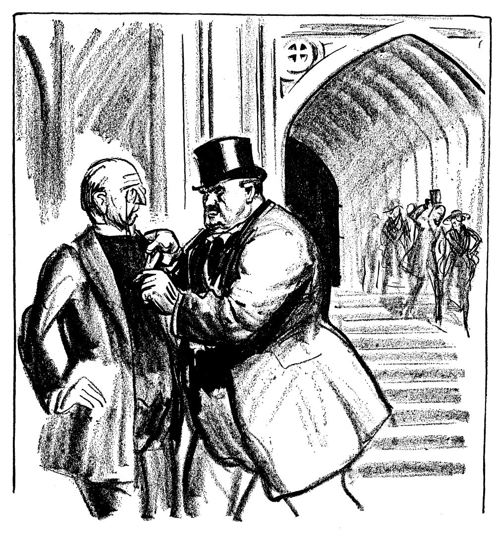
"Lay off Pittsburgh-stick to the next world!"

How trivial the "corruption" that can at best only help to ward off the horrors of starvation, compared to that which opens the avenue of investment, and enables the corrupt and their heirs and assigns forever to sit comfortably upon the backs of the people!