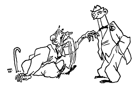
And now, I've saved up enough money to -