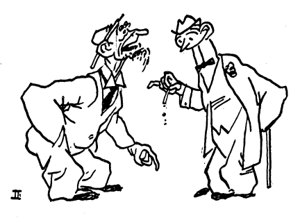
When I was your age I worked eighteen hours a day-