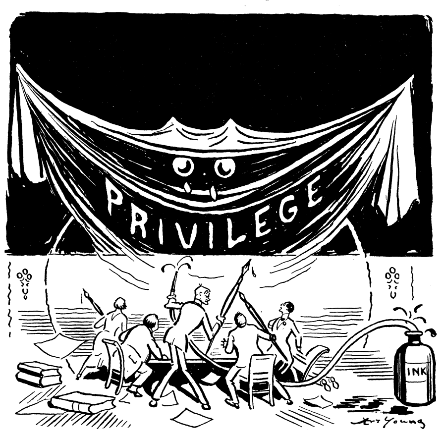
The Freeman Editors' Weekly Attack.

I said, you may remember, that we are distinguished, we literary and artistic people, not by our ability to think, but by our ability to realize—to feel and express the qualities of things. And this faculty of vivid living—"besides the ultimate and absolute value that it has in itself—contributes something indispensable to the practical movement. It contributes something that we might call inspiration . It keeps up a certain warm faith and laughing resolution in those who might weary of learning and laboring in the mere practical terms of the task." Upon the basis of that statement