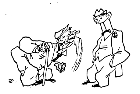
The boss was proud of me-I did all the work in the place!