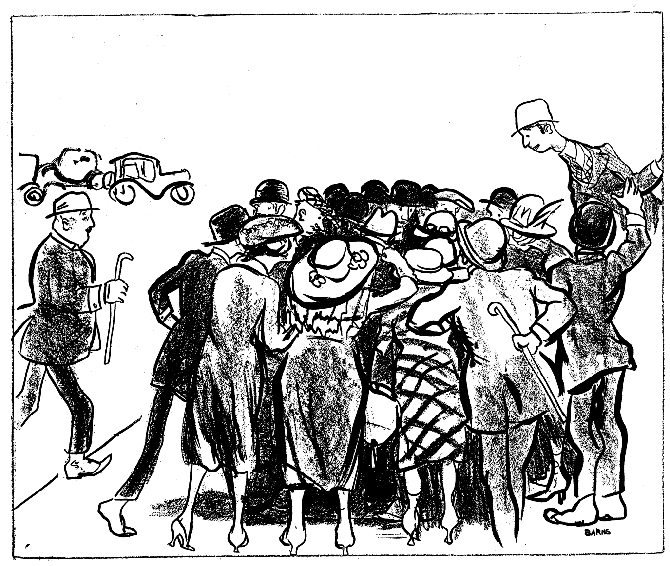
"My God! what's the matter?" "A cat's got some catnip!"

rather than go to work. He wants to live, but he doesn't know anything and doesn't make a rational statement in the whole seven scenes. Naturally, the police get after him, here and hereafter, but they don't do him any good. Policing the unconscious proves, in fact, too big a task for even the Second Assistant God in the Heavenly Police Court, and no one gets the idea that his chief could do much better.