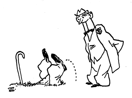
- Rest up -