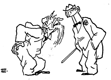
Young man, I supported a whole family!