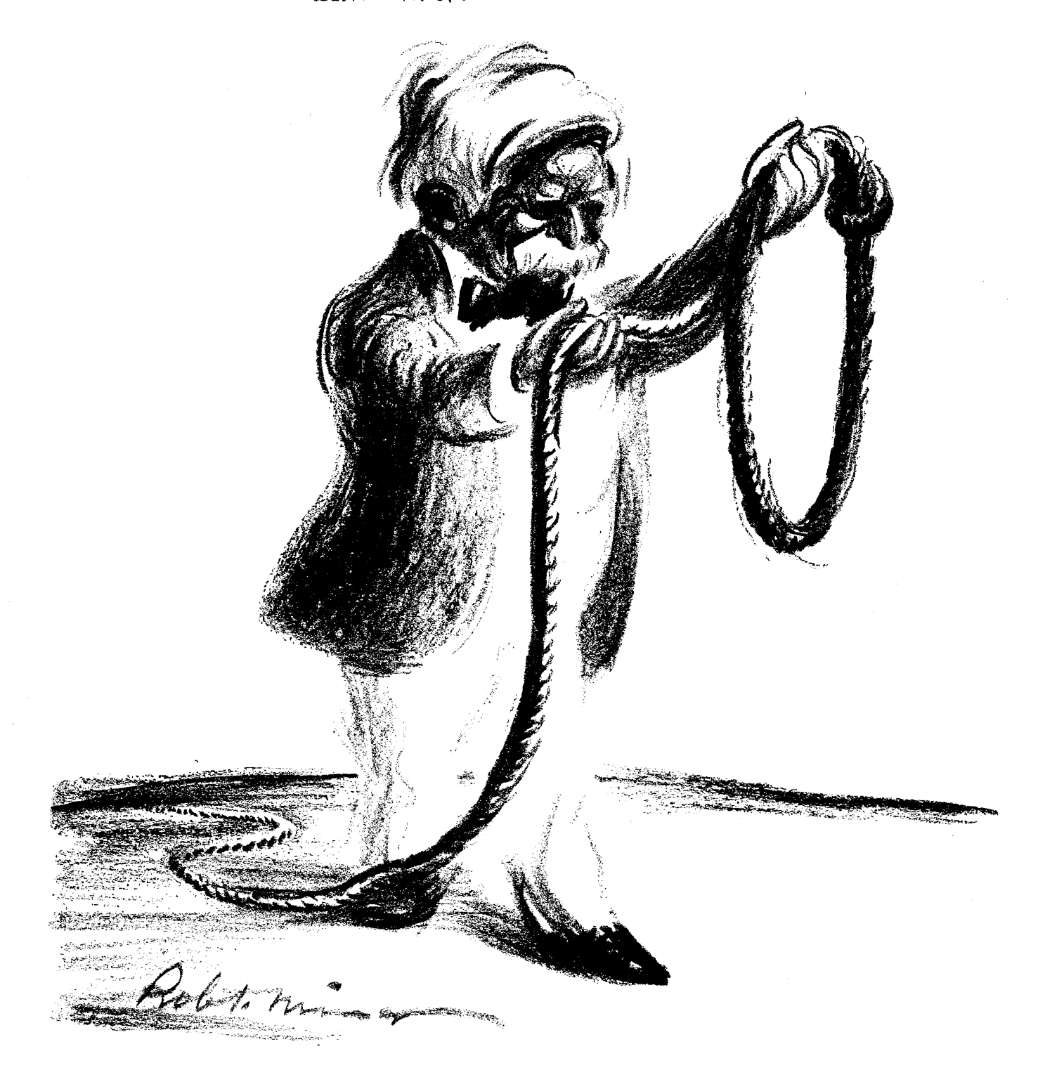
"Having made the world safe for democracy, we must now settle the Irish question"