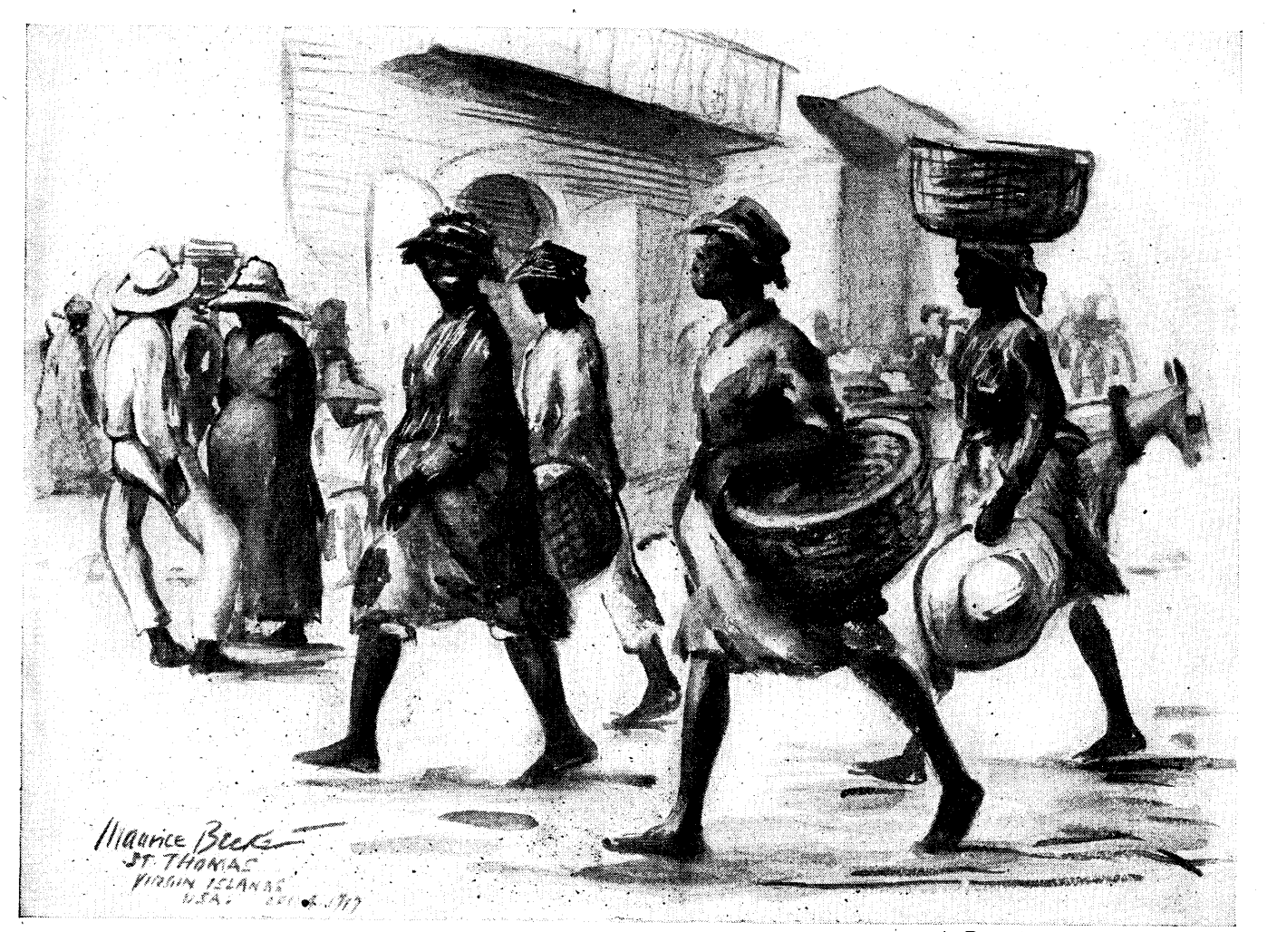
A Drawing by Maurice Becker.