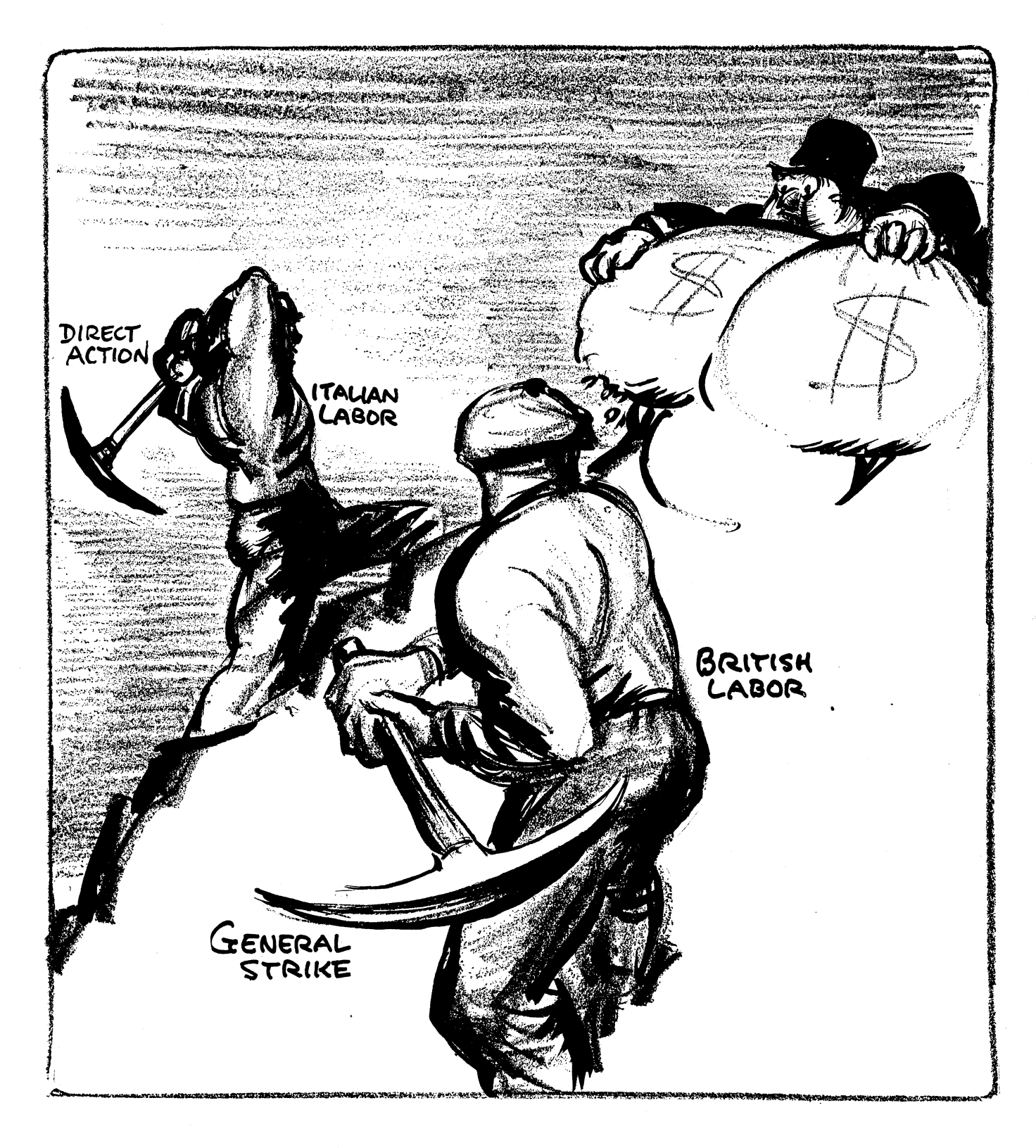
"Hey, quit that! Ain't you fellows got the vote?