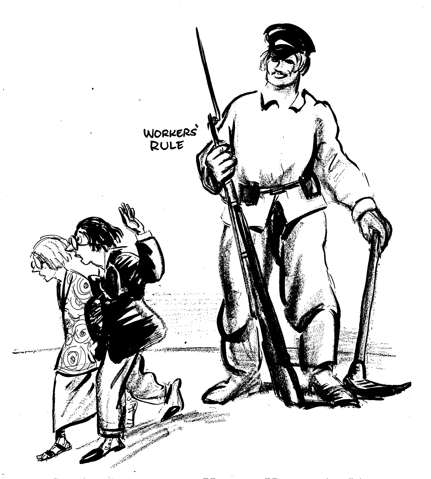
Socialist Investigators: "Horrors! How crude! It's much nicer just to dream about it!"