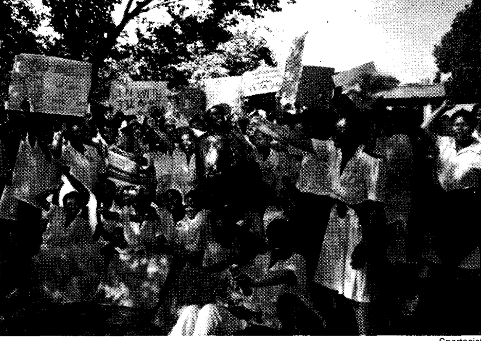
Nurses during 1995 wildcat strike carried signs reading "Away with Mandela," denounced ANC leader as "driver of gravy train" for aspiring black capitalists. ANC government fired 6,000 nurses after strike.

The oppression of women and children is bound up with the role of the bourgeois monogamous family under capitalism, where women are treated as property of men, slated to raise the next generation of wage slaves. The oppression of women may take an even more extreme form in the traditional African family, especially when polygamy is still sanctioned. The