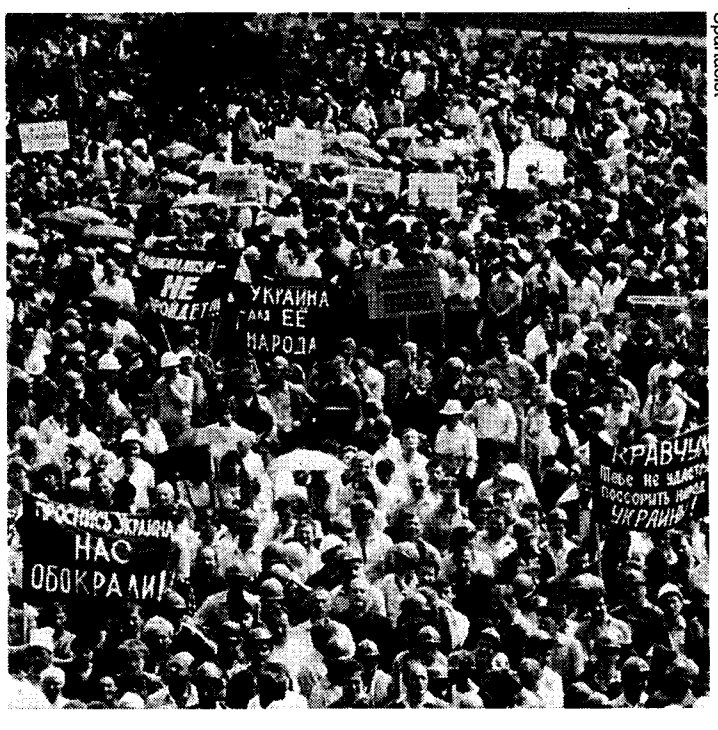
Rally by striking Ukrainian miners, 1993. Banners include: "Nationalism Shall Not Pass!"

The appetite among the Ukrainian bourgeoisie for greater investment from the West, which already accounts for 80 percent of all direct foreign investment, has exacerbated the tensions between those looking to maintain Ukraine's traditional ties to Russia and those seeking to draw closer to the U.S. and the European Union (EU). Despite its current pro-Russian posture, the Ukrainian regime has continuously tried to suck up to U.S. imperialism since the counterrevolution, agreeing to Washington's dictates to destroy its nuclear arsenal (for a price) and deploying troops to participate in the colonial occupation of Iraq. For that matter, Putin's Russia has been more than willing to act as soft cops for U.S./NATO imperialism when the situation availed itself, as in Kosovo in 1999, and heartily continued on page 12