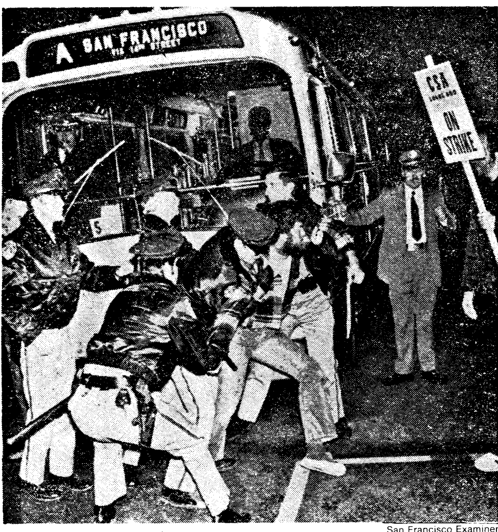
Police attack strikers during spring 1974 S.F. strike wave.

Cringing before bourgeois "public opinion," the reactionary labor bureaucracy has not sought to mobilize labor action against this onslaught but instead is trying to defeat the Proposition by pandering to the anti-labor vote. Thus