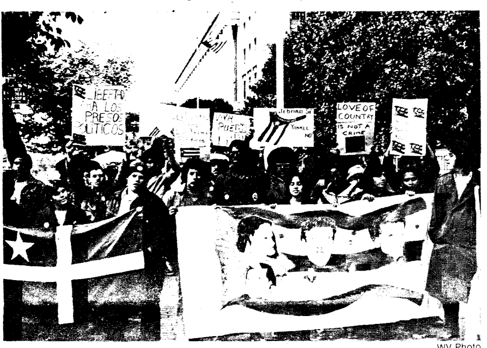
Demonstrators in Washington, D.C., October 1973, demand freedom for Puerto Rican political prisoners.

peasantry; the objective alliance of the local ruling class to U.S. Imperialism as its very existence, its very dependence on the continued imperialist domination of Puerto Rico and the existence of a petty bourgeoisie whose interests become closely bound to U.S. capitalists' interests. These aspects of Puerto Rican society coupled with the existence of a numerically large working class determine that strategically the struggle for Puerto Rican independence is fundamentally and predominantly a struggle for socialism."