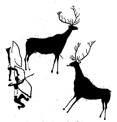
HUNTING SCENE Stone Age Painting

The quest for food is the most compelling concern of any society, for no higher forms of labor are possible unless and until people are fed. Whereas animals live on a day-to-day basis of food-hunting, humanity had to win some measure of con-