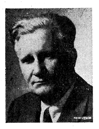
JAMES P. CANNON National Chairman Socialist Workers Party

It appears to me now, in the light of the conflict in the party and its real causes which are now manifest, that those sections of the Convention Resolution, dealing with the class as