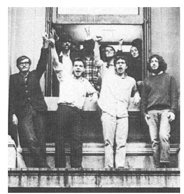
1968. Students take over Low Library at Columbia University

In November 1969, 143,000 General Electric workers were on strike as 500,000 anti-war demonstrators packed Washington, DC. PLP led thousands in a breakaway demonstration to the Labor Department to