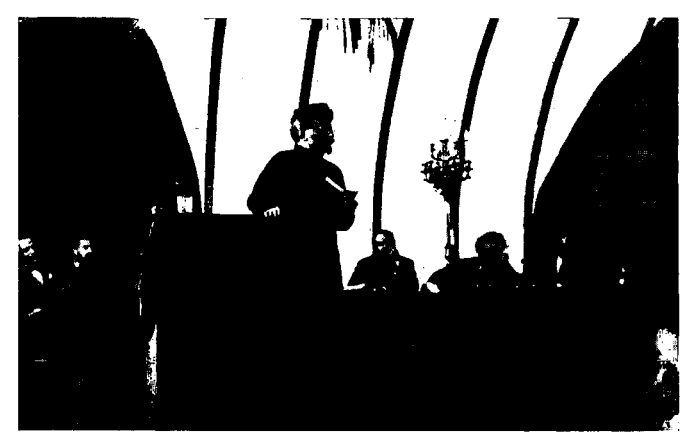
Trotsky addressing the Fourth Congress of the Communist International.